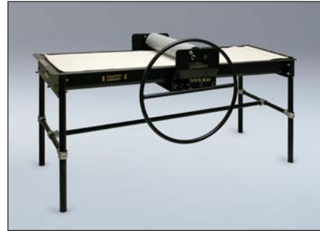
SR-20 Slab Roller