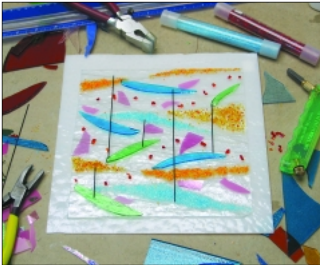
Compose a design on the base glass by arranging colored frits, threads and confetti.