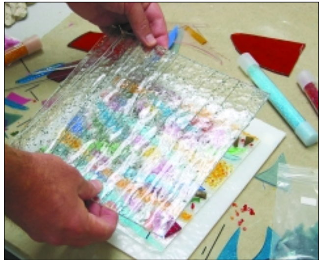
An optional step involves laying a larger size glass sheet over the base sheet.