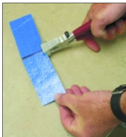
Cut and snap glass sheets apart with glass pliers.