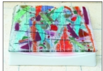
Slumping glass, by placing an already full fused piece over a mold, then firing again, creates a shaped vessel.

10. Close the lid and program the "Glass Select Fire" control for "slump" mode. Refer to the AMACO/Excel GSF-045 and GSF-670 operating manuals, page 9, for Slow, Medium, or Fast settings. Or use the chart on page 2.