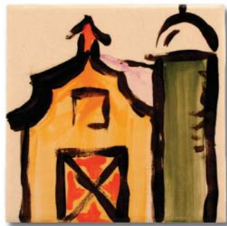
"Farm Scene" by Noelle Hoover, Indianapolis, Indiana shows GDC's under AMACO® LG-10 Clear glaze.

GDC's as underglaze with AMACO® Clear Transparent LG-10 or HF-10 on top: Used on cone 04 bisque, GDC's are an easy to apply underglaze color. Use three coats for opaque coverage or 1-2 coats to see the clay body underneath. Sponge or brush one coat of LG-10 lightly followed by two flowing brush coats for dinnerware safe surfaces. Tip: this technique can be used with High Fire HF-10 for cone 5/6 firings.