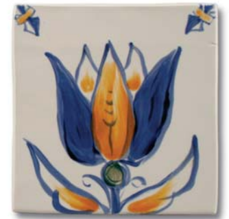
"Dutch Studies" by Diana Faris, Indianapolis, Indiana shows GDC's over AMACO HF-11 White glaze.

GDC's over pre-glazed tile: Most pre-glazed ceramic ware can be decorated using GDC's with beautiful effects. Unlike other glazes, GDCs will not crack, run, or flake off most pre-fired surfaces. Fire to cone 04 and always test first to ensure clay body and temperature compatibility. Tip: look for ware marked "porcelain" or "microwave" safe.