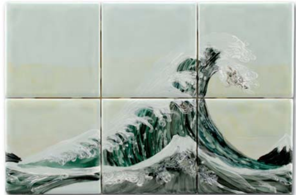
"Waves" by Noelle Hoover, Indianapolis, Indiana shows AMACO® GDC's over pre-glazed wall tiles.

GDC's over pre-glazed tile: Most pre-glazed ceramic ware can be decorated using GDC's with beautiful effects. Unlike other glazes, GDCs will not crack, run, or flake off most pre-fired surfaces. Fire to cone 04 and always test first to ensure clay body and temperature compatibility. Tip: look for ware marked "porcelain" or "microwave" safe.