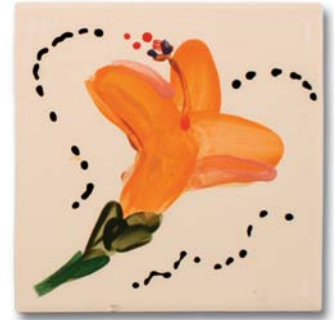
"Spring Flowers" by Jeff Sandoe, Indianapolis, Indiana shows GDC's alone on unglazed bisqued tiles.

GDC's over AMACO® White HF-11 cone 5/6 for "High Fire Majolica": Used over HF-11, GDC's will retain crisp brush strokes and color at mid and high fire temperatures. Use 3 flowing coats of HF-11 Opaque White to cone 04 bisque and 1-3 coats of GDC for translucent to Opaque designs, fire to cone 5. GDC colors will begin to move on vertical surfaces at temperatures above cone 6.