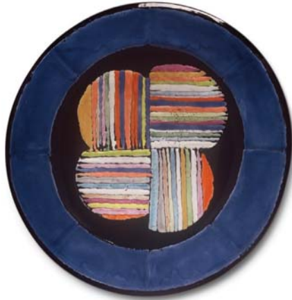
"Neo-majolica Platter" by Walter Ostram, Nova Scotia, Canada, shows GDC's over AMACO® LM-1 glaze.

GDC's used over AMACO® Liquid Matt Black LM-1 or AMACO® Deco Gloss Black Lacquer DG-1: Apply three coats of Black glaze to 04 bisque ware. Use three coats of GDC for opaque bright colors over black or 1 to 2 coats for varying degrees of GDC color saturation. Warm colors like Light Red, Yellow or Violet will appear brighter, cool colors like Mint Green, Medium Blue, or Purple will appear darker.