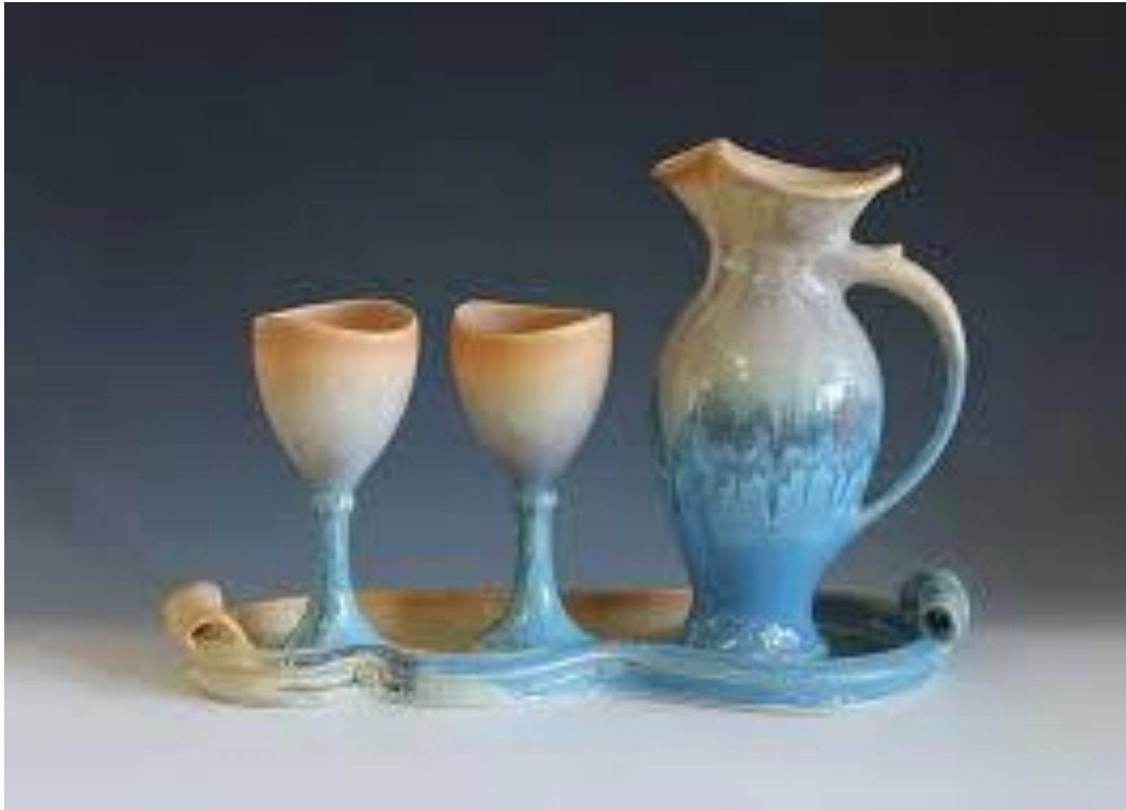
Pitcher, Cups, and Tray Set (aggressive)