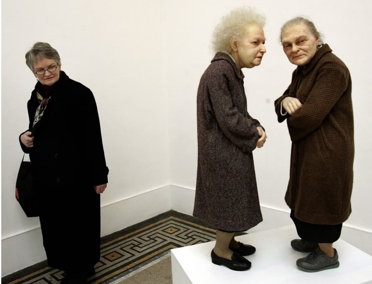
A visitor looks at a sculpture titled "Two Women" by artist Ron Mueck at the Brooklyn Museum