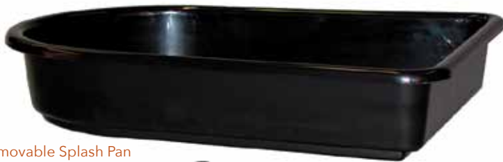
Removable Splash Pan

Holds hours of trimmings. When you are done just pop off the wheel head and carry the whole pan, trimmings and all, to empty. Oh... and no leaks.