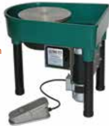
Built in Splash Pan